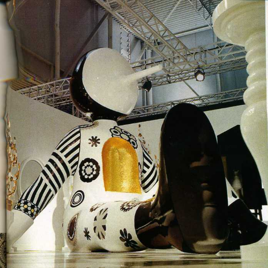
From Top Mixing art with industrial application, the installation for Bisazza at Salone 2007. Unique shaped vases for Bisazza add fun to everyday living, The Single Poltrona for BD Ediciones de Diseno is inspired by classical MGM musicals Website: www.hayonstudio.com