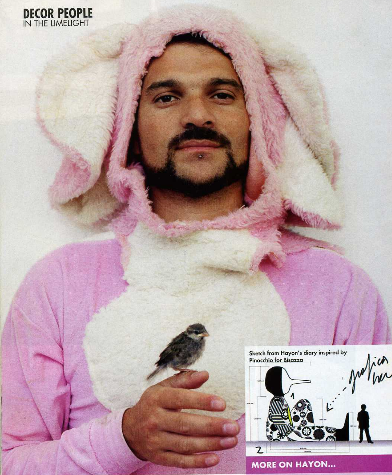
Sketch from Hayon's diary inspired by Pinocchio for Bisazza